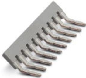
Insertion bridge, pitch: 6.2 mm, number of positions: 10, color: gray

Please be informed that the data shown in this PDF Document is generated from our Online Catalog. Please find the complete data in the user's documentation. Our General Terms of Use for Downloads are valid ( http://phoenixcontact.com/download )