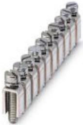
Fixed bridge, pitch: 6.2 mm, number of positions: 10, color: silver

Please be informed that the data shown in this PDF Document is generated from our Online Catalog. Please find the complete data in the user's documentation. Our General Terms of Use for Downloads are valid ( http://phoenixcontact.com/download )