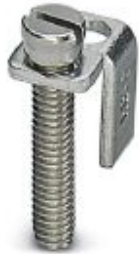
Chain bridge, pitch: 6 mm, number of positions: 1, color: silver

Please be informed that the data shown in this PDF Document is generated from our Online Catalog. Please find the complete data in the user's documentation. Our General Terms of Use for Downloads are valid ( http://phoenixcontact.com/download )