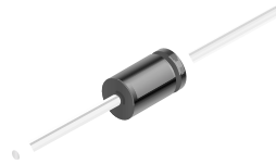
DO-41 Glass case COLOR BAND DENOTES CATHODE