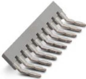
Insertion bridge, pitch: 6.2 mm, number of positions: 10, color: gray

Please be informed that the data shown in this PDF Document is generated from our Online Catalog. Please find the complete data in the user's documentation. Our General Terms of Use for Downloads are valid ( http://phoenixcontact.com/download )