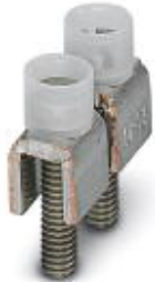
Fixed bridge, Number of positions: 2, Color: silver

Please be informed that the data shown in this PDF Document is generated from our Online Catalog. Please find the complete data in the user's documentation. Our General Terms of Use for Downloads are valid ( http://download.phoenixcontact.com )