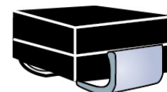
DO-214AA J-bend Package

NOTE: All SMB series are equivalent to prior SMS package identifications.