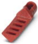
Coding profile for HC-MOD-K... housing