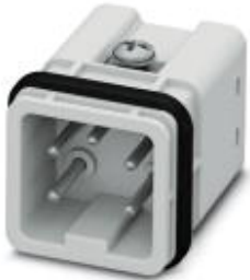
Contact insert, Size: D7, Number of positions: 4+PE, Pin, Push-in connection, 230 V, 10 A, 0.14 mm 2 ... 1.5 mm 2

Please be informed that the data shown in this PDF Document is generated from our Online Catalog. Please find the complete data in the user's documentation. Our General Terms of Use for Downloads are valid ( http://phoenixcontact.com/download )