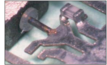
Anode, fuse and leadframe assembly

TBW Fused Tantalum Capacitors offer protection from possible damaging short circuit failure modes. This is accomplished with an internal fuse in series with the capacitor. See the photograph on the right. The AVX fused tantalum offers lower ESR limits than competitive fused tantalum capacitors, and is available with Weibull and surge testing per MIL PRF 55365.