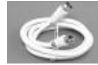
RG-59 Hook-up Cables with Molded Strain Relief 75 Ohm, Packaged for Retail Display.