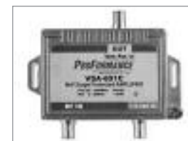
Digital Ready Drop Amplifier 54 MHz to 1 GHz (Boxed)

This full-size Amplifier features 6 KV combination wave surge protection, triple plated Zinc housing for maximum corrosion protection, diecast Zinc plated 'F' Connectors and an Internal Diplexor for increased band isolation. Power Adapter included, and available with or without Power Inserter. Power Adapter included.