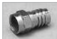
Crimp-On F-56 (M) for Teflon/Plenum RG-6 Cable.