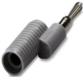
Reducing plug, color: gray

Please be informed that the data shown in this PDF Document is generated from our Online Catalog. Please find the complete data in the user's documentation. Our General Terms of Use for Downloads are valid ( http://phoenixcontact.com/download )