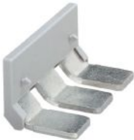
Insertion bridge, pitch: 36 mm, number of positions: 3, color: gray

Please be informed that the data shown in this PDF Document is generated from our Online Catalog. Please find the complete data in the user's documentation. Our General Terms of Use for Downloads are valid ( http://phoenixcontact.com/download )