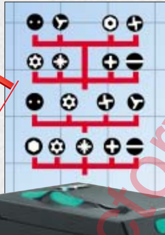
Extremely versatile, to accommodate whatever screwdriving challenge the job-site might offer.