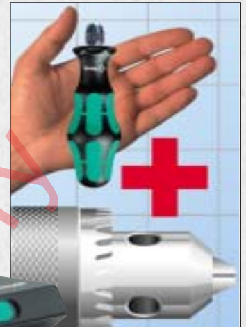
Kraftform Kompakt® - for both manual and machine operation.

Mobility and flexibility are the trend in our modern industrial world. Over 90 % of service technicians need tools for both manual and power screwdriving (rechargeable battery, electro or pneumatic screwdrivers) in their work.