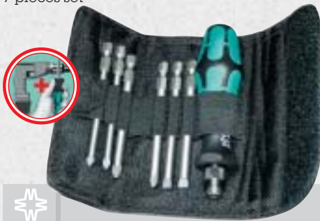
Kraftform Kompakt® 40 pouch with 89 mm long bits 7 pieces set