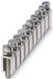
Fixed bridge, pitch: 6.2 mm, number of positions: 10, color: silver

Please be informed that the data shown in this PDF Document is generated from our Online Catalog. Please find the complete data in the user's documentation. Our General Terms of Use for Downloads are valid ( http://phoenixcontact.com/download )