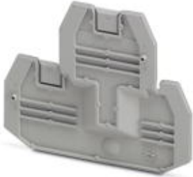
End cover, length: 69.9 mm, width: 2.2 mm, height: 57.5 mm, color: gray

Please be informed that the data shown in this PDF Document is generated from our Online Catalog. Please find the complete data in the user's documentation. Our General Terms of Use for Downloads are valid ( http://phoenixcontact.com/download )