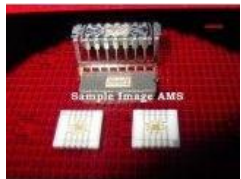
2N3638A Si PNP Lo-Pwr BJT

In Stock 8508 Brand New Available from $ 3.23