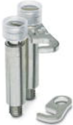
Switching jumper, pitch: 13 mm, number of positions: 2, color: silver

Please be informed that the data shown in this PDF Document is generated from our Online Catalog. Please find the complete data in the user's documentation. Our General Terms of Use for Downloads are valid ( http://phoenixcontact.com/download )