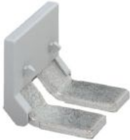
Insertion bridge, pitch: 31 mm, number of positions: 2, color: gray

Please be informed that the data shown in this PDF Document is generated from our Online Catalog. Please find the complete data in the user's documentation. Our General Terms of Use for Downloads are valid ( http://phoenixcontact.com/download )