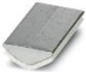
Insertion profile, color: silver