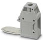
Pick-off terminal block, nom. voltage: 1000 V, nominal current: 57 A, connection method: Screw connection, number of connections: 1, cross section: 0.5 mm 2 - 10 mm 2 , AWG: 20 - 8, width: 10.2 mm, height: 34.7 mm, color: gray, mounting type: on base element

Pick-off terminal block - AGK 10-UKH 50 - 3001763