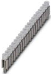
Fixed bridge, Pitch: 6 mm, Number of positions: 100, Color: silver

Please be informed that the data shown in this PDF Document is generated from our Online Catalog. Please find the complete data in the user's documentation. Our General Terms of Use for Downloads are valid ( http://phoenixcontact.com/download )