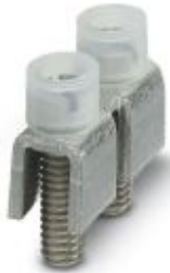
Fixed bridge, pitch: 15 mm, number of positions: 2, color: silver

Please be informed that the data shown in this PDF Document is generated from our Online Catalog. Please find the complete data in the user's documentation. Our General Terms of Use for Downloads are valid ( http://phoenixcontact.com/download )