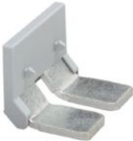
Insertion bridge, pitch: 36 mm, number of positions: 2, color: gray

Please be informed that the data shown in this PDF Document is generated from our Online Catalog. Please find the complete data in the user's documentation. Our General Terms of Use for Downloads are valid ( http://phoenixcontact.com/download )