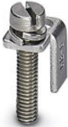
Chain bridge, Number of positions: 1, Color: silver

Please be informed that the data shown in this PDF Document is generated from our Online Catalog. Please find the complete data in the user's documentation. Our General Terms of Use for Downloads are valid ( http://phoenixcontact.com/download )