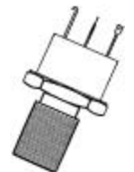
2N6689, 2N6690 TO-61*