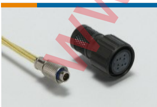
Standard Circular Connectors (116)

Need help? Our team is on stand-by and ready