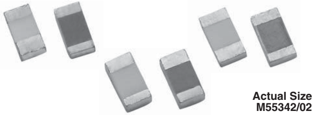
Actual Size M55342/02

Thin Film Mil chip resistors feature all sputtered wraparound termination for excellent adhesion and dimensional uniformity. They are ideal in applications requiring stringent performance requirements. Established reliability is assured through 100 % screening and extensive environmental lot testing. Wafer is sawed producing exact dimensions and clean, straight edges.