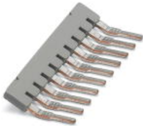
Insertion bridge, 10-pos., fully insulated

Please be informed that the data shown in this PDF Document is generated from our Online Catalog. Please find the complete data in the user's documentation. Our General Terms of Use for Downloads are valid ( http://phoenixcontact.com/download )